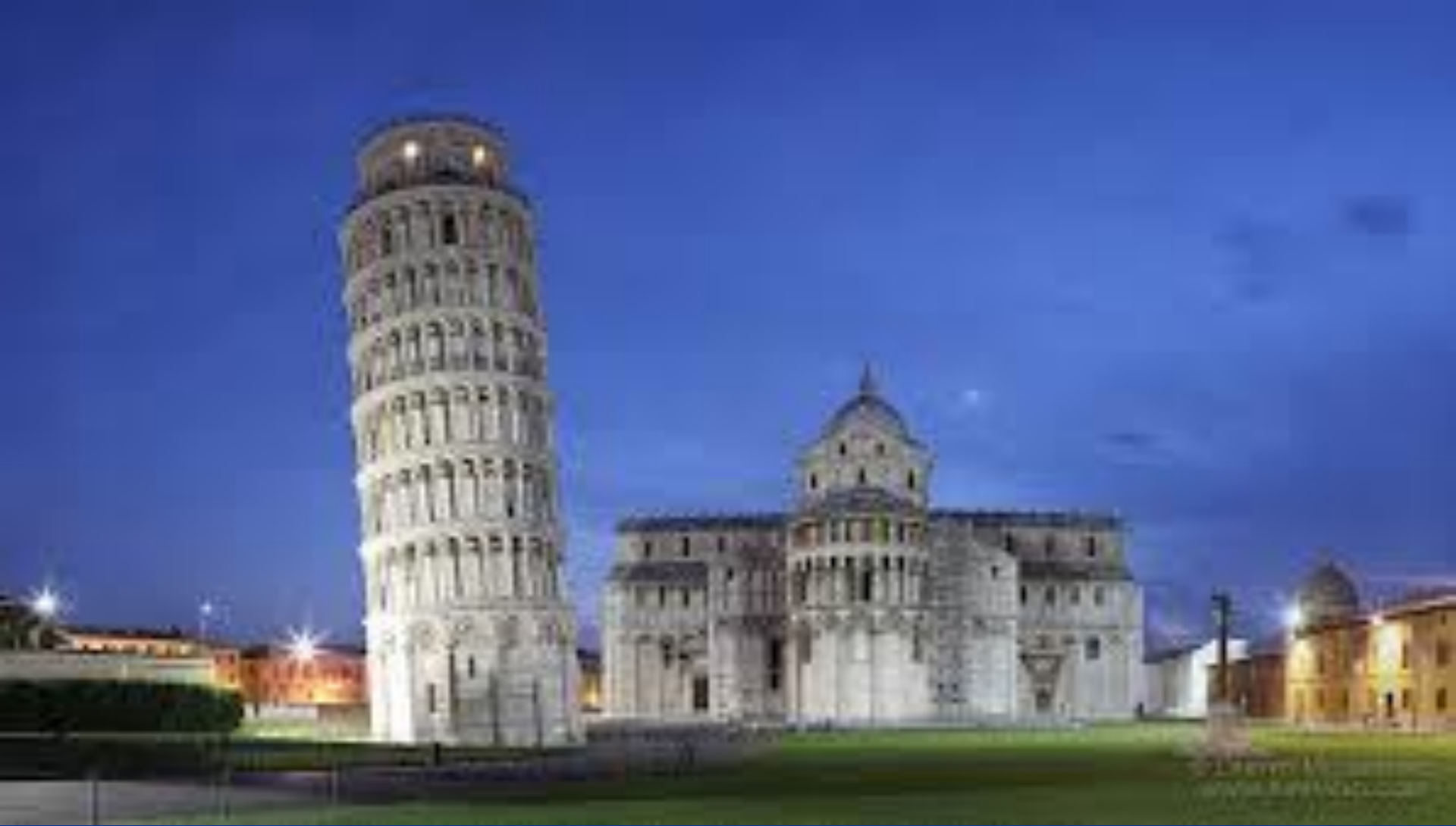
THE LEANING TOWER OF PISA, ITALY